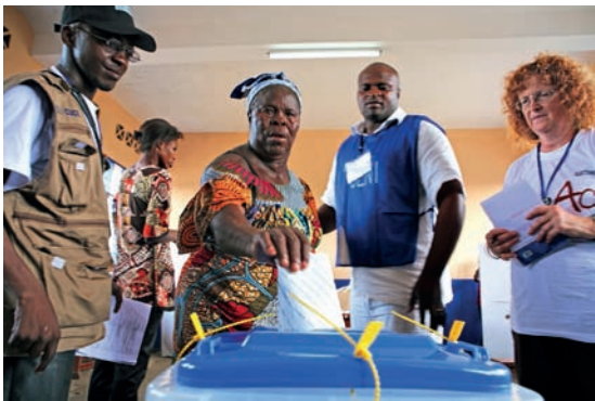
Cover picture : Woman voting during 2011 presidential elections in Kinshasa, DR Congo